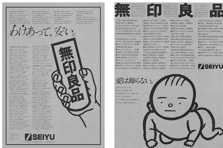
Figure 1: (left) MUJI Poster 'Cheap with Good Reason', 1980 Figure 2: (right) MUJI Poster 'Love doesn't Decorate Itself', 1981 https://www.MUJI.com/jp/flagship/huaihai755/archive/koike.html

Starting in the 1990s, Japan fell into a long depression; nevertheless, MUJI's sales increased, and the company expanded, opening more stores (3). However, around 2000, sales suddenly dropped, and in 2001, the company reorganized its operations and reaffirmed its original concept (4). In 2002, communication designer Kenya Hara joined MUJI's advisory board and immersed himself in the company's conceptual strategy.