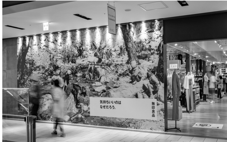
Figure 6: MUJI Osaka Shop and Campaign Poster ‘Pleasant, somehow’, 2021