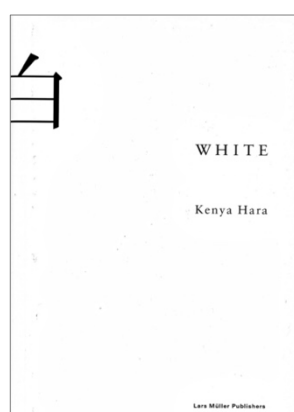
Figure 7: Kenya Hara, White , 2008. (left) Japanese version, (right) English version