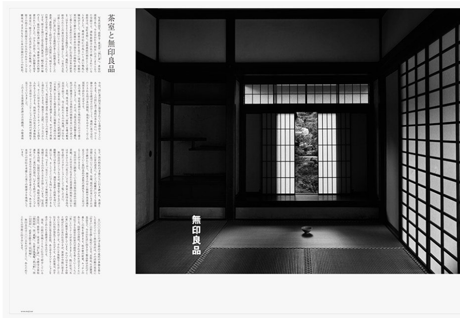
Figure 5: Newspaper Advertisement ‘Tea Room and MUJI’, 2005 https://www.ndc.co.jp/hara/works/2018/04/MUJI-a.html

MUJI has been working to simplify not only each product but also the living space where the objects are displayed. MUJI’s forte is storage items that are designed to be used in combination in a modular fashion. MUJI has been trying to develop ideas of tidiness by developing a product development method based on observation (7). In 2014, an observational study was conducted in Hong Kong, where living spaces are even more limited than in Japan, and the following year, a renovation case study based on the aforementioned research was exhibited (8). MUJI’s observational methods became known through the media, and the company responded to the Hong Kong case study by developing customer services that proposed simple living around the world.