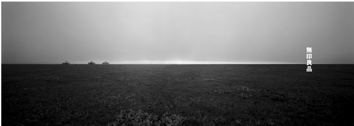
Figure 3: (above) MUJI Poster 'Horizon, Uyuni', 2003